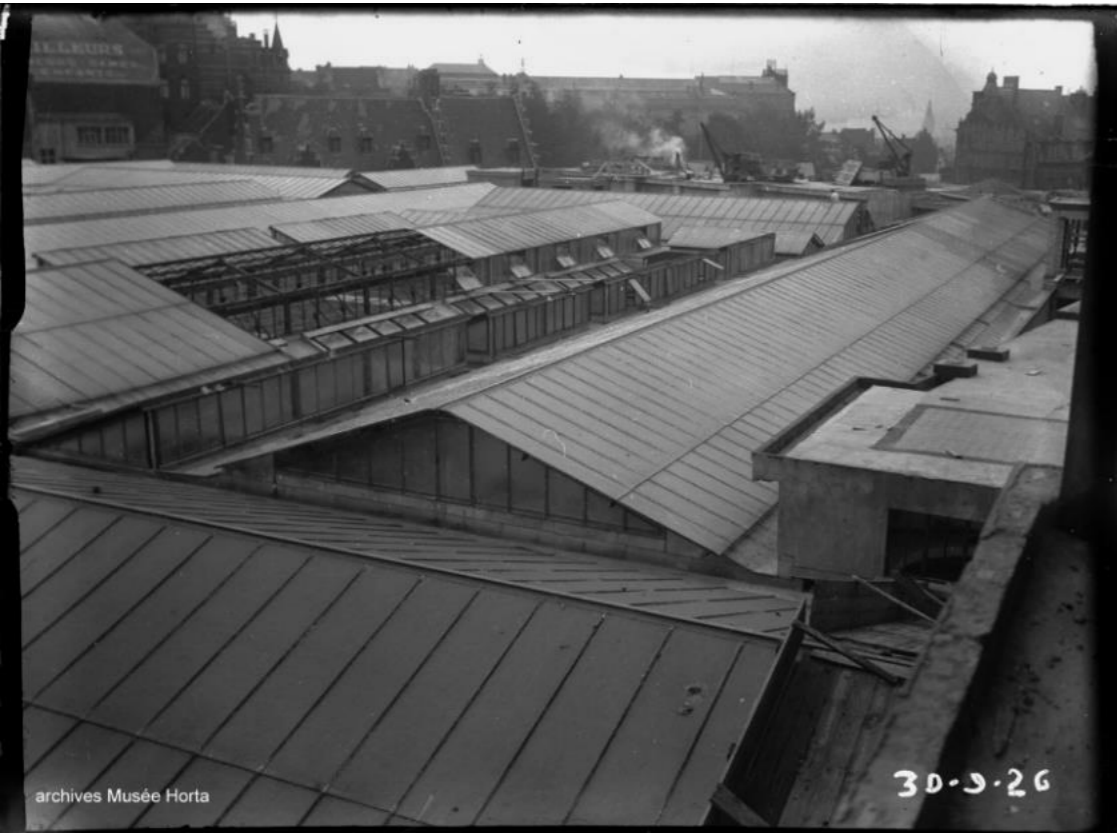
Palais des Beaux-Arts, 1926