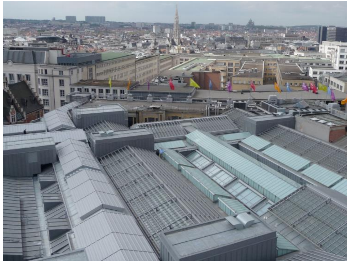
BOZAR after restoration of the roofs, 2012

RAYMOND LEMAIRE International Centre for Conservation